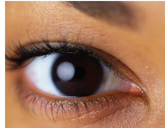
An online eye test cannot see into your eyes to determine health.

The American Optometric Association and its member doctors of optometry are first and always focused on protecting patients' health and safety. The currently marketed mobile vision apps are promising health care, but they are delivering much less than the accepted standard of care, which calls for an in-person comprehensive eye examination. Through an in-person, comprehensive examination, doctors of optometry assure precise and healthy vision, identify and treat glaucoma and serious infections and ensure early diagnosis of immediate threats to overall health, including hypertension, stroke and diabetes, which may have no obvious signs or symptoms.